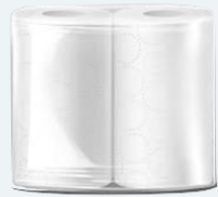
Plastic wraps on paper towels and toilet paper