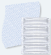
Bubble wrap & pillow packs