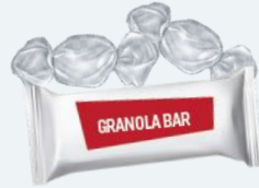
Candy & granola wrappers*