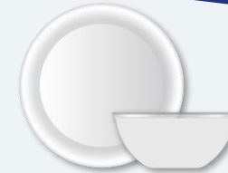
Plastic plates & bowls