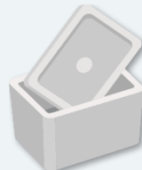
Foam block packaging