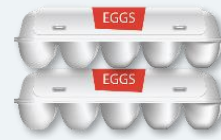
Foam egg cartons