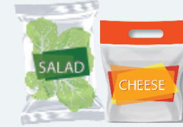
Salad & cheese bags