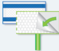
Dry/wet disposable cleaning cloths