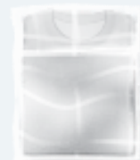
Clear plastic overwrap