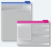
Food storage bags