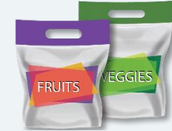
Fresh/frozen veggie/fruit bags

*no foil lining, may have ink printing on bag