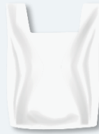
Plastic grocery bags