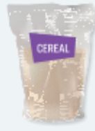
Dry mix liners (cake, powder, cereal, cookies)