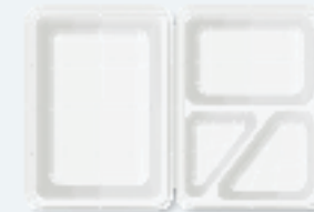
Foam to-go boxes, cups, plates & bowls